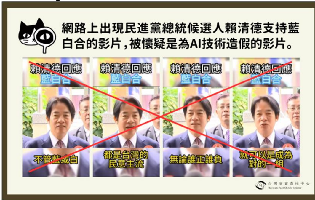
Figure 2: AI-Generated Voice on Fabricated Video

A screenshot of the fabricated video in which the DPP presidential candidate Lai Ching-te appeared to support the cooperation of the KMT and the TPP party in the 2024 Taiwanese presidential campaign. The Taiwan FactCheck Center has debunked this video as untrue.